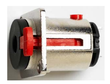
Model 6877 1/4" Receptacle, Panel Mount, Locking